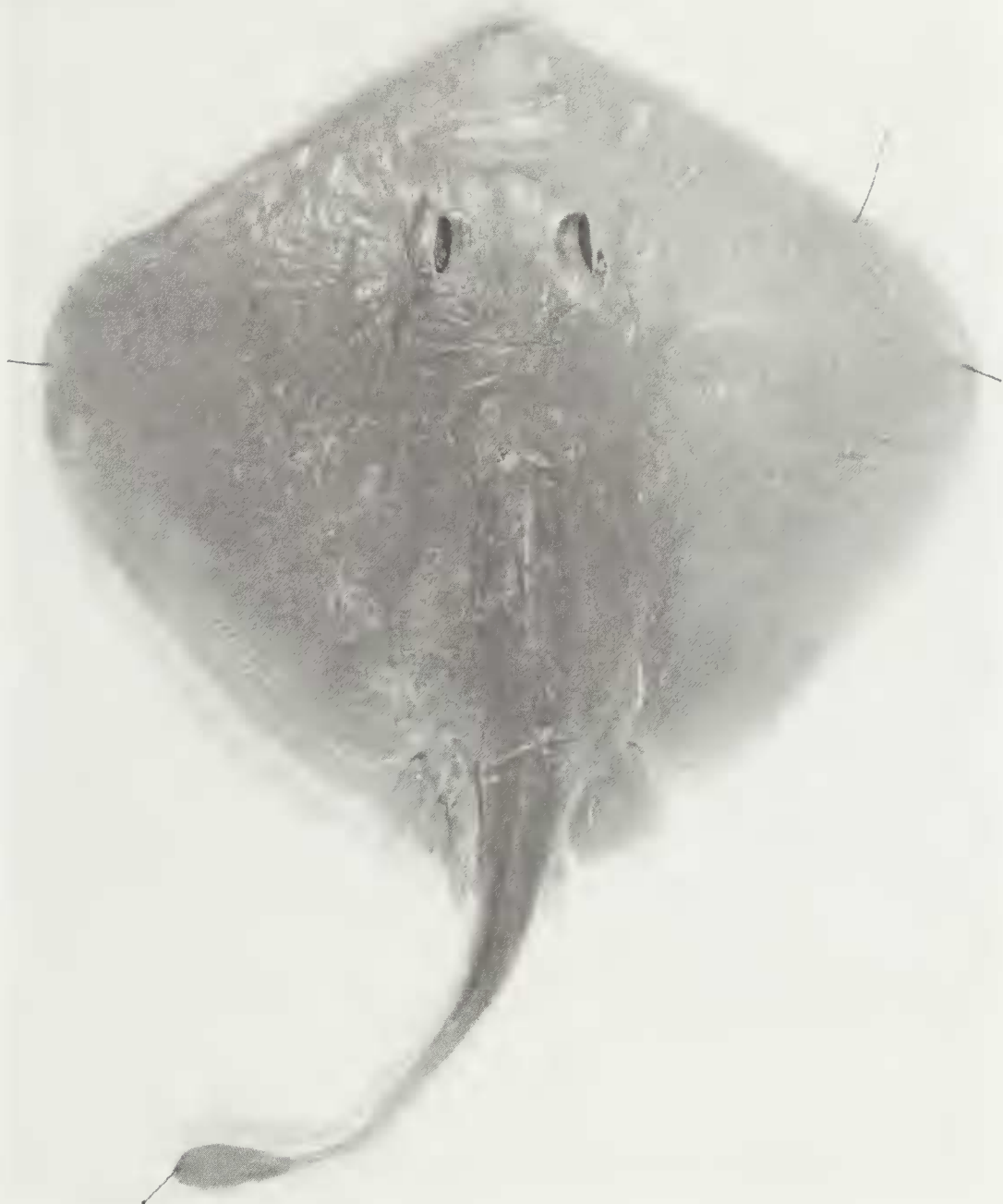
Figure 6. Urolophus westraliensis , holotype, CSIRO CA2870.